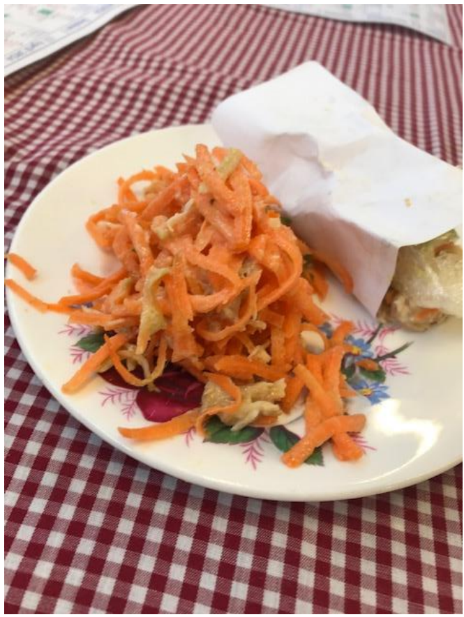
The amount of carrot far exceeded the sandwich from which it came.

Anyway, another mediocre session followed. I blamed this on the combination of sheer drops and drops, no, dollops of carrot. I can only say if you want a few good boards off me on a Tuesday night at the club, you can get me to drive up Mt Te Aroha beforehand and then buy me dinner with carrots. Fortunately, the staff at "The Grand" are well primed as my nickname there is "Mr No Carrot". I think now my reputation has spread as far as the lovely North Shore Bridge Club!